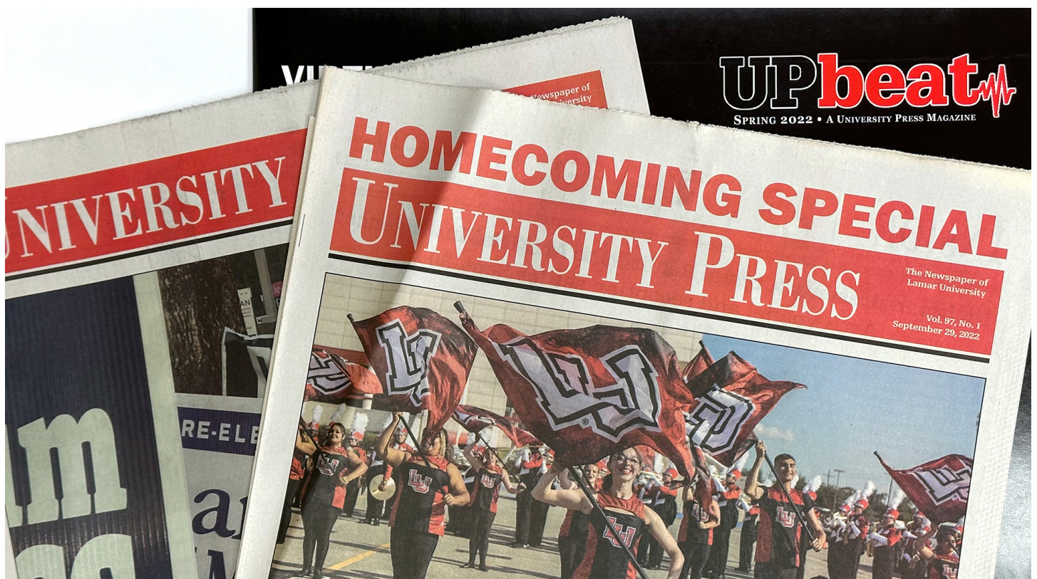
UP offering print edition during Cardinal View on March 4

So, I cemented my legacy by being the "If she can do it so can you" girl. But that's fine. Playing the tuba is an experience that once seemed unimaginable, but eventually became unforgettable.