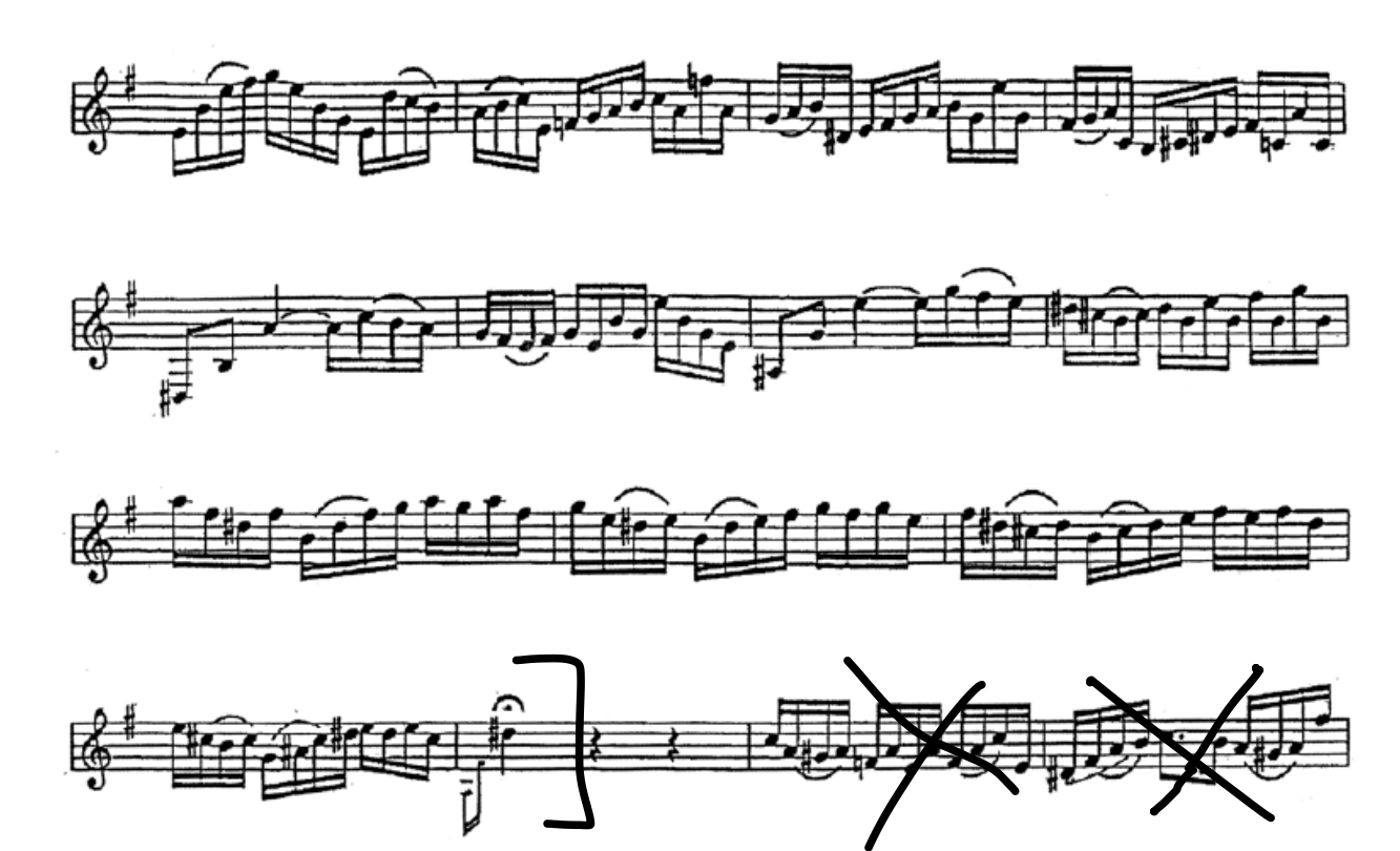
Grainger: Lincolnshire Posy, Mvt. 3 (Bass Clarinet)

Bach: Cello Suite No. 2 in D minor, Prelude (2/2)